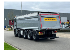
MAN TGS 50.460 10x4 Reference: 0895