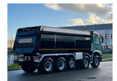
Mercedes-Benz Arocs 5053 10x8 Manufactured in 2018